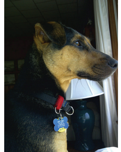
A true Yankee at heart, Keeper is always on the lookout for a good deal.

Once you complete the course, your CE credit will be recorded and you will have access to download and print a Certificate of Completion.